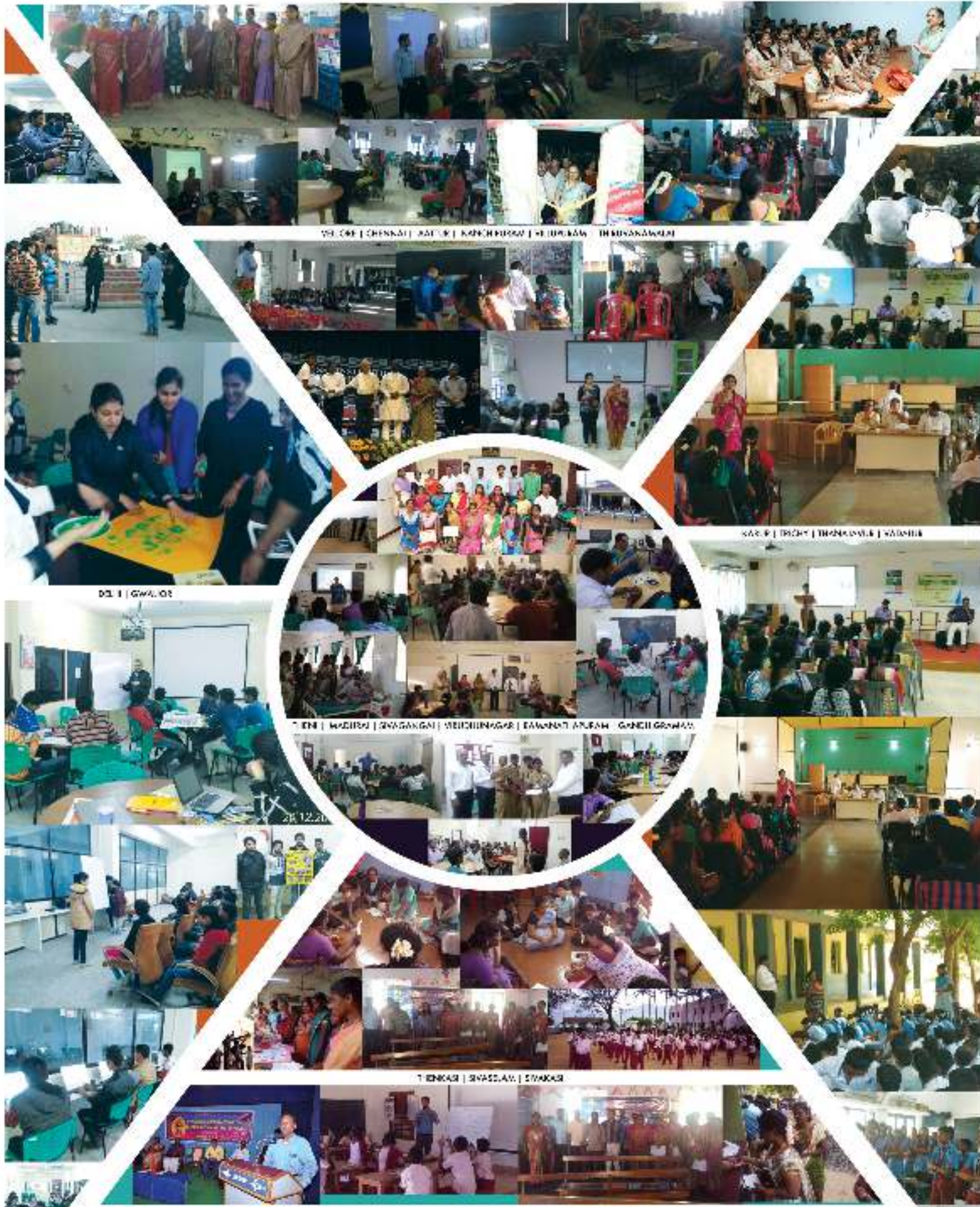
VELUORE | CHENNAI | KATUK | KANCHIPURAM | HEJURKAW | THIRUVANANTHURAI